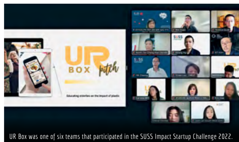
UR Box was one of six teams that participated in the SUSS Impact Startup Challenge 2022.