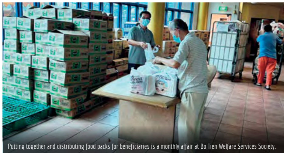
Putting together and distributing food packs for beneficiaries is a monthly affair at Bo Tien Welfare Services Society.