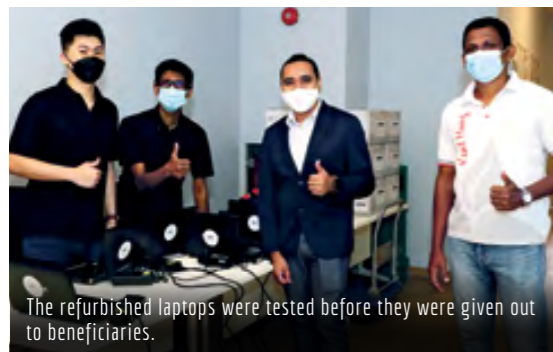
The refurbished laptops were tested before they were given out to beneficiaries.