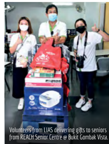
Volunteers from LIAS delivering gifts to seniors from REACH Senior Centre @ Bukit Gombak Vista.