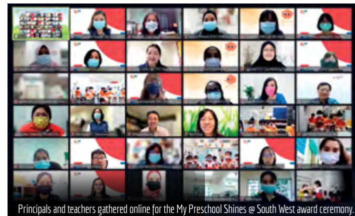
Principals and teachers gathered online for the My Preschool Shines @ South West award ceremony.