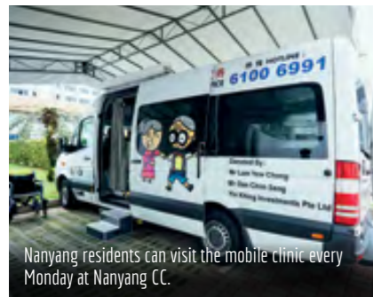
Nanyang residents can visit the mobile clinic every Monday at Nanyang CC.