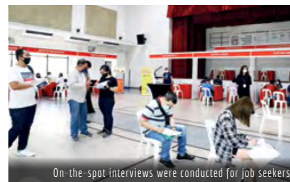
On-the-spot interviews were conducted for job seekers.