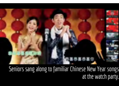
Seniors sang along to familiar Chinese New Year songs at the watch party.