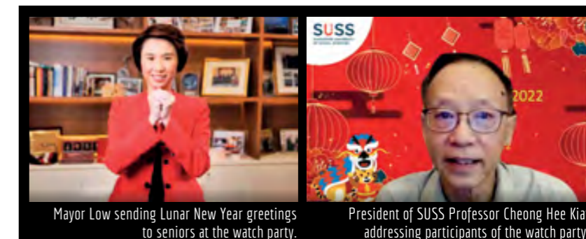
Mayor Low sending Lunar New Year greetings to seniors at the watch party.