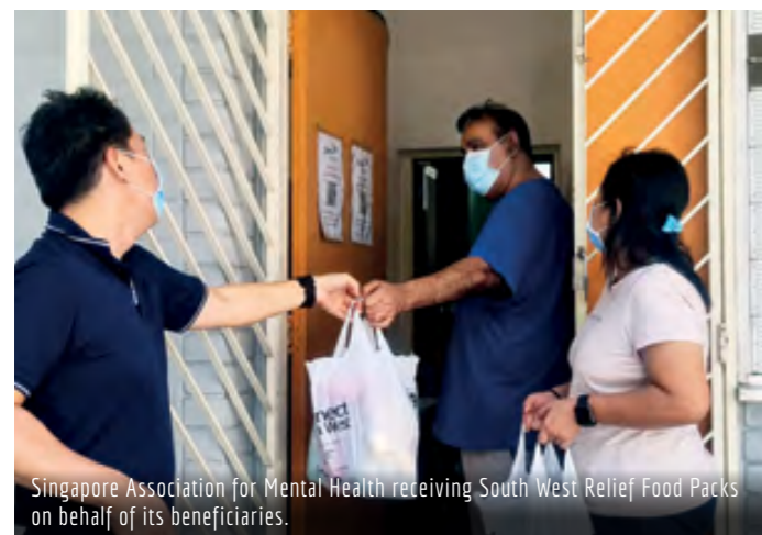
Singapore Association for Mental Health receiving South West Relief Food Packs on behalf of its beneficiaries.