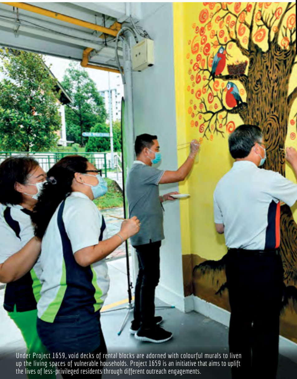
Under Project 1659, void decks of rental blocks are adorned with colourful murals to liven up the living spaces of vulnerable households. Project 1659 is an initiative that aims to uplift the lives of less-privileged residents through different outreach engagements.