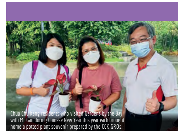
Chua Chu Kang residents who visited Gardens by the Bay with Mr Gan during Chinese New Year this year each brought home a potted plant souvenir prepared by the CCK GROs.

The Corridor Gardening initiative that sees residents planting vegetables at their doorsteps is another initiative that the Chua Chu Kang division has embarked on. “Since we pride ourselves as a city in a garden, why not make every home a garden,” Mr Gan quips. Under this initiative, Chua Chu Kang residents can purchase a gardening starter kit (including a planter box, soil, gardening tools, vegetable seeds, and a frame to hold the planter box) for just $8. “We want to create a community. We created a Facebook group and encouraged participants to share their successes and solutions there. We also involve students and NParks to teach seniors how to plant the edible vegetables,” he shares enthusiastically, adding that these lessons were previously held physically but switched to being conducted virtually now. The initiative has proven to be a good way to de-stress and connect with other residents as COVID-19 hit shortly after it was introduced. “Residents continue to show strong interest, and we have over 800 people waiting to get their kits,” reveals Mr Gan. When asked if he is into gardening, the 63-year-old says with a laugh, “I don’t have green fingers, but I keep some plants at home and keep trying.”