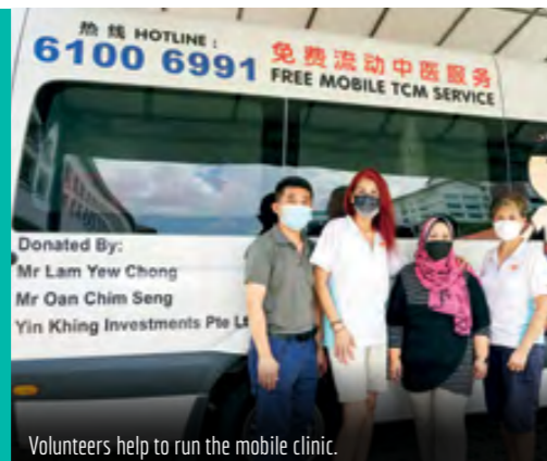
Volunteers help to run the mobile clinic.

The mobile TCM clinic at Nanyang CC runs every Monday from 10am to 4.30pm. Nanyang residents can book an appointment a week in advance with the clinic's volunteers at Nanyang CC.