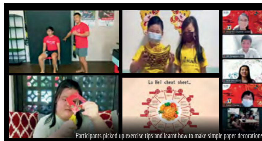
Participants picked up exercise tips and learnt how to make simple paper decorations.

SENIORS FROM NURSING HOMES AND SENIOR DAY CARE CENTRES SOAKED UP THE EXUBERANCE OF THE PARADE THROUGH A VIRTUAL WATCH PARTY.