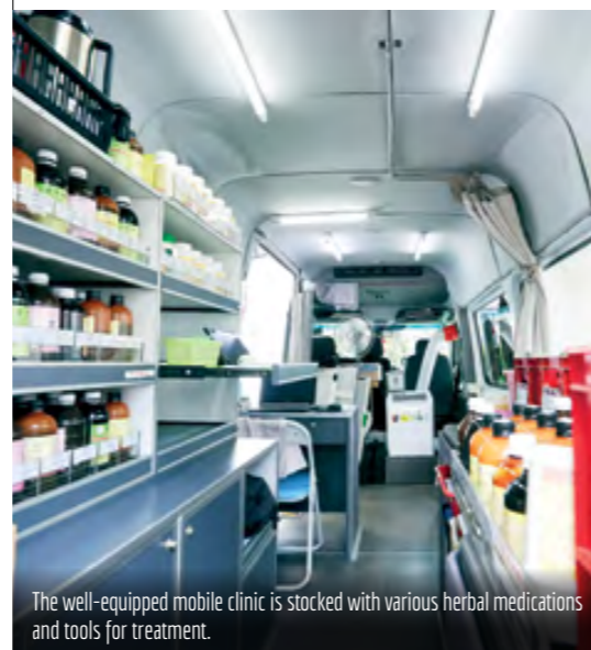
The well-equipped mobile clinic is stocked with various herbal medications and tools for treatment.