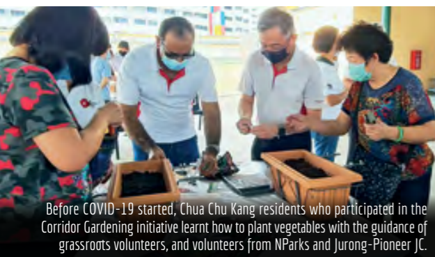
Before COVID-19 started, Chua Chu Kang residents who participated in the Corridor Gardening initiative learnt how to plant vegetables with the guidance of grassroots volunteers, and volunteers from NParks and Jurong-Pioneer JC.

I visited quite a number of parks at the end of last year. It’s hard to come together to do things because my children are grown up and have their own activities. We all took leave and spent some time exploring Singapore instead of travelling overseas. Going to Yishun Dam was my wife’s idea. It was an enjoyable walk. We also went to the Botanic Gardens, Windsor Park and National Gallery. I also took an evening walk along Marina Bay with my family, and we enjoyed the view. I hope to take residents there as the area looks beautiful at night.