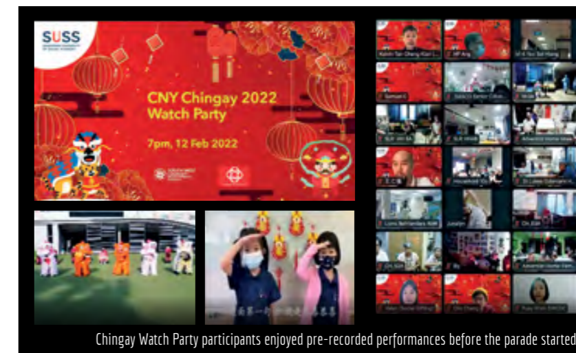
Chingay Watch Party participants enjoyed pre-recorded performances before the parade started.