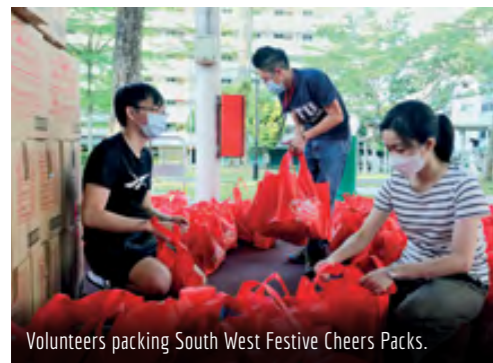
Volunteers packing South West Festive Cheers Packs.