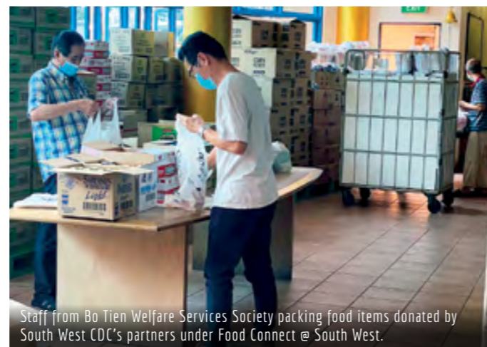
Staff from Bo Tien Welfare Services Society packing food items donated by South West CDC's partners under Food Connect @ South West.